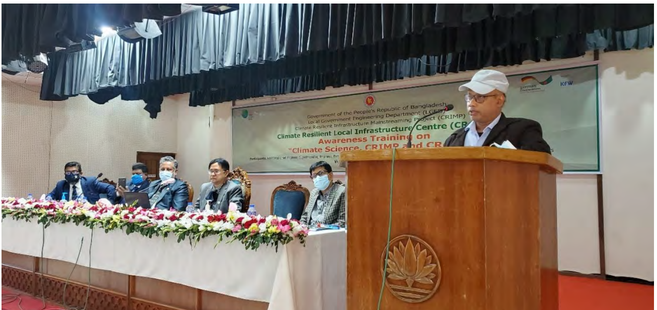
Presentation on KMS