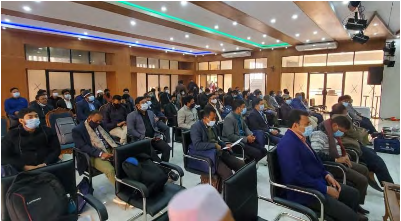
A view of the Participants attending the Awareness Training